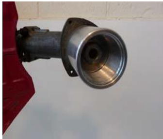
Fig 3 CHAMP Jnr 2 secured on Riser