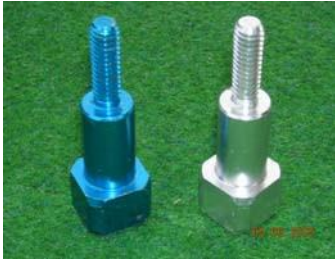
Fig 2 Adaptor Bolt