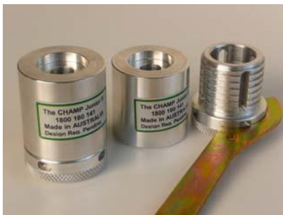
CHAMP Jnr. 2 and 2 piece components