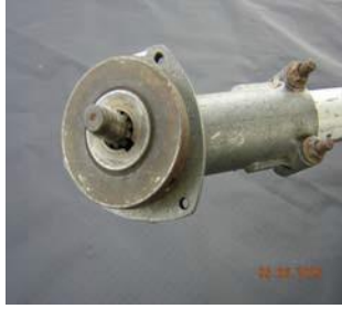
Fig 1 25 mm Riser