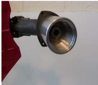
Fig 3 CHAMP Jnr 2 secured on Riser